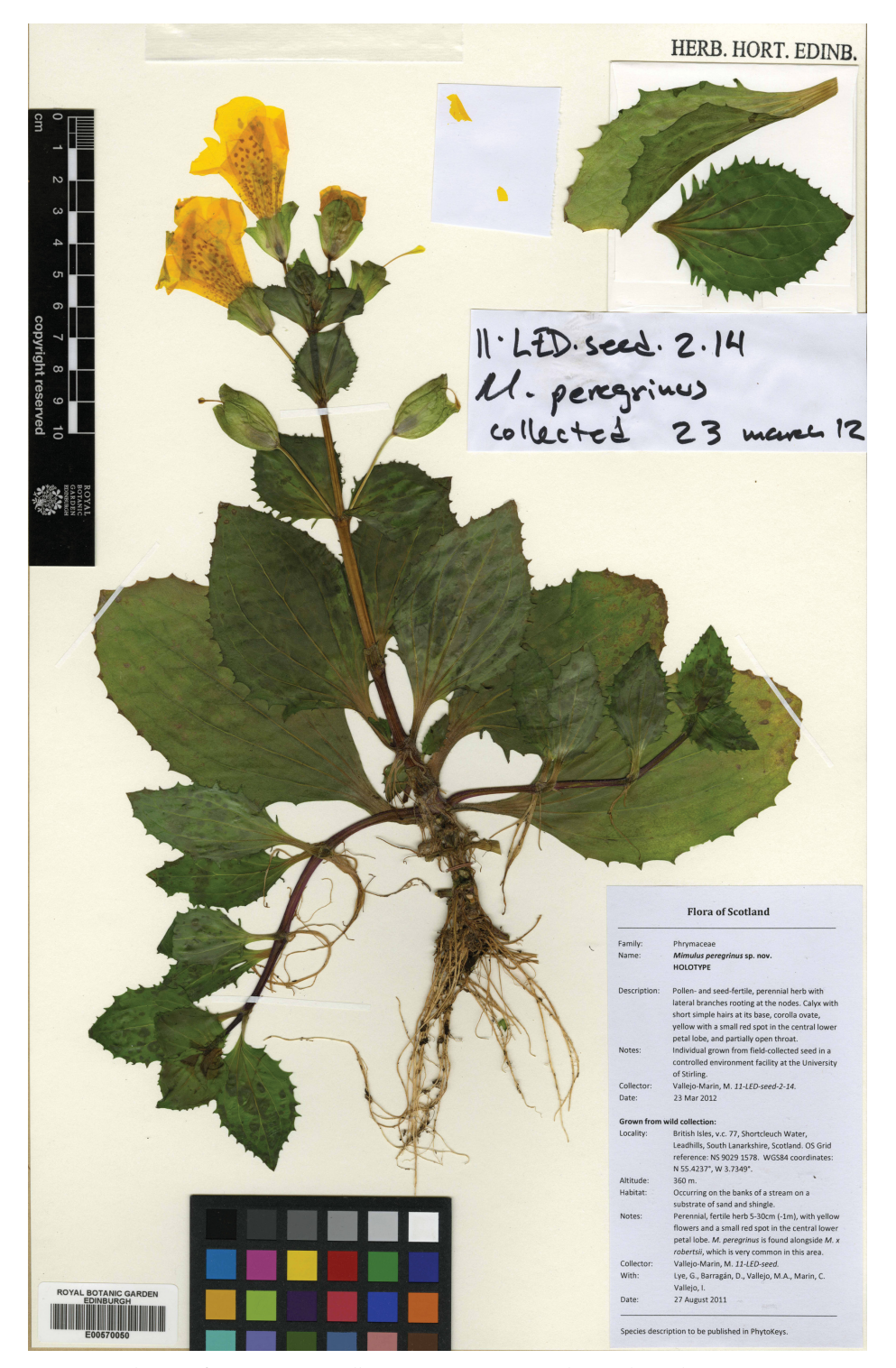
Figure 1. Holotype of M. peregrinus Vallejo-Marin [11-LED-seed-2-14; barcode E00570050].