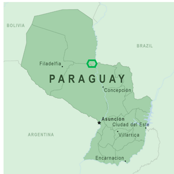
Fig. 1 Map of Paraguay. Green circle represents the study area (Alto Paraguay Chaco), located 650 km from the capital Asunción.

16–24 hours) where Ziehl–Neelsen (ZN) stain, GeneXpert MTB/RIF (Cepheid) and mycobacterial culture (Ogawa–Kudoh solid medium) were performed. The gold standard to establish TB diagnosis was a positive culture of Mycobacterium tuberculosis complex. In case mycobacterial cultures were contaminated, a new sputum sample was cultured extended with cultures for fungi and respiratory pathogens.