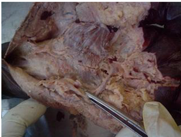
Figure 3 Specimen with absent avascular plane along the TCL. Thenar and hypothenar muscle attachments encroach upon each other across the midline.

Corresponding parameters in our study were noted to be 11.5 mm, 7.8 mm and 27.0 mm respectively (Table 1).