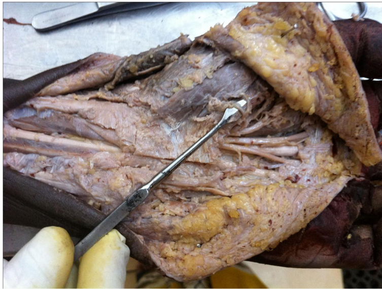
Figure 2 Dissected specimen showing multiple extra ligamentous recurrent branches of the median nerve (pointer).