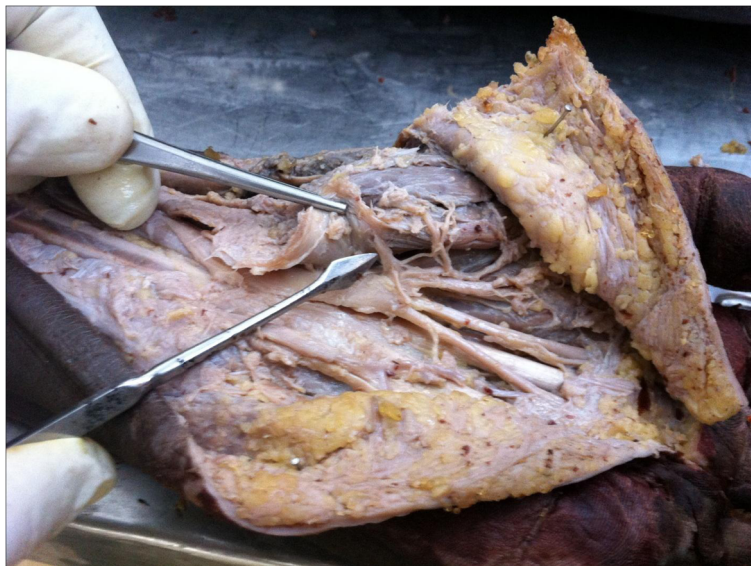
Figure 1 Dissected specimen showing an intra ligamentous recurrent branch of the median nerve (pointer).

Mean distance from the distal border of transverse carpal ligament to the superficial palmar arch was 11.48 mm.