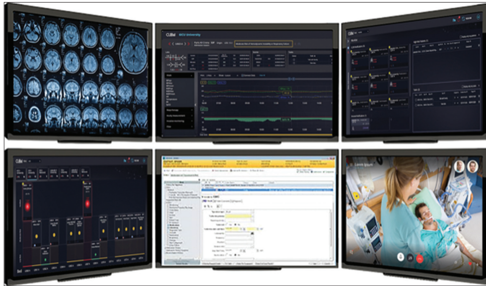
Figure 2: Model of CLEW AI-based tele-ICU [27]

while also improving efficiency and resource allocation. Nonetheless, it is crucial to exercise prudence when utilizing this technology in a responsible and right manner.