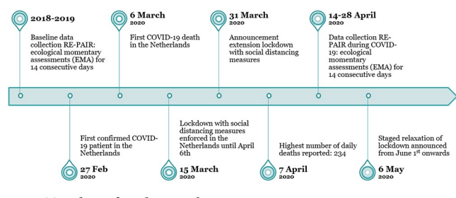
Fig 1. Timeline of study period.

One of the key questions that have been raised by governmental agencies and health care workers is to what extent the COVID-19 pandemic and the associated distancing measures affect families' well-being and parenting behaviors. In this study, Dutch adolescents and their parents filled in 14 days of ecological momentary assessments (EMA; [11]) twice, before the COVID-19 outbreak (2018–2019) and also during the COVID-19 pandemic (14–28 April 2020). In addition, we asked parents and adolescents about daily difficulties and helpful activities during the COVID-19 pandemic that possibly influenced their affect in positive