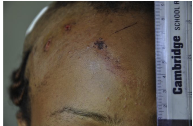
Fig. 1C. Right side of the forehead and right fronto-parietal regions