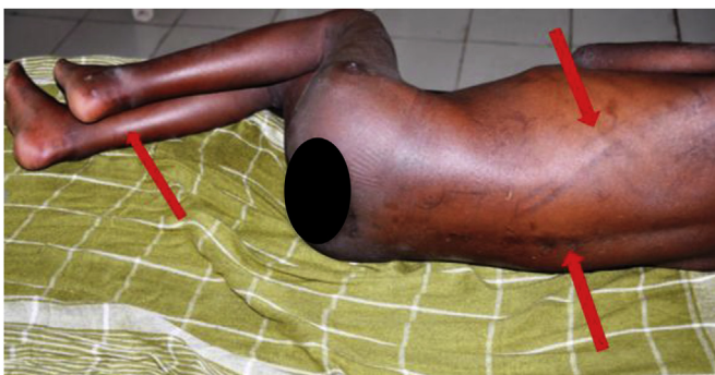
Fig. 2B. 8

Injuries are different stages of healing. Multiple tramline bruises of varying lengths and in different directions.