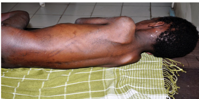
Fig. 2A. 7

At the Police Station, the couple was arrested. The child was escorted to a medical facility where he was examined, treated and discharged (without medication). These photographs were captured as part of the examination at a public medical facility. The examiner conducted the examination in a resource poor setting.