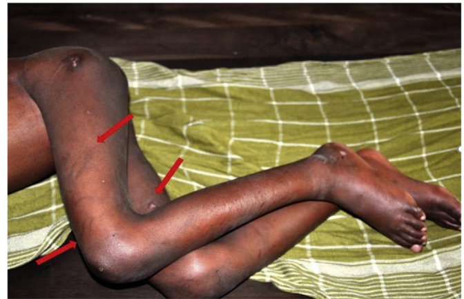
Fig. 2C. 9

Multiple healing scratch marks and linear abrasions scattered over the lower back.