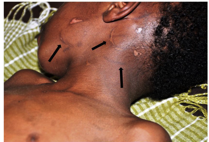
Fig. 2D. 10

Tramline bruises, Pressure sores, Bilateral pedal edema, Distended abdomen, undernourished.