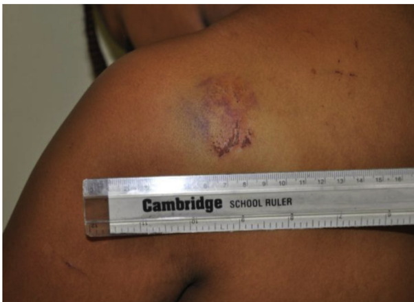
Fig. 1A. Left shoulder blade