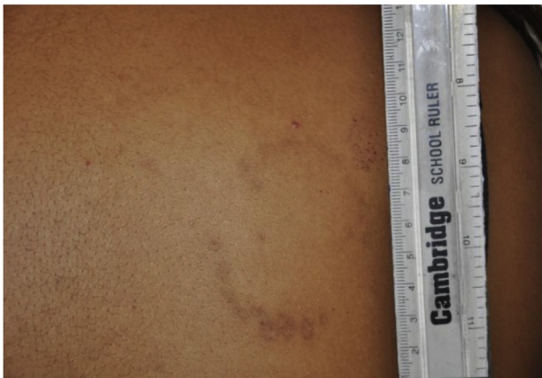
Fig. 1B. Right Shoulder blade