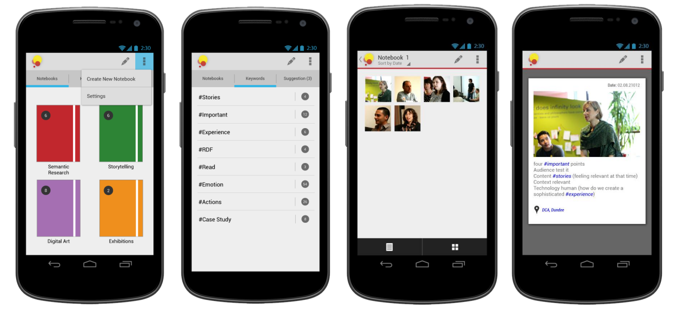
Figure 2: The Semantic Sketchbook. From left to right: Notebook view (creating a new notebook and personalising the cover), Goal list (keywords and goals), Sort By: Visual and date, Keywords and Multimodal notes with Goals (Tags in the body of the text).