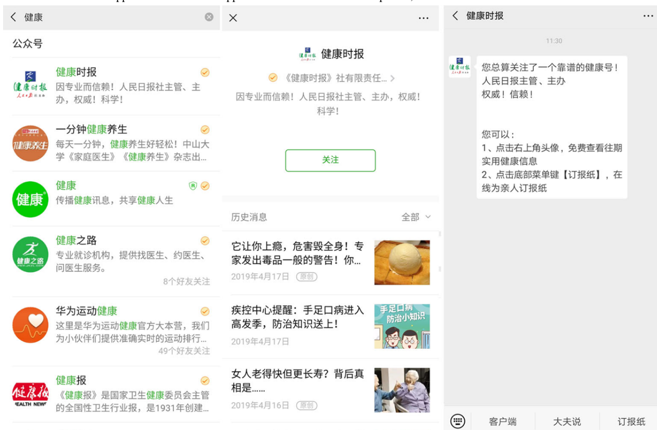
Figure 1. Examples of WeChat public accounts (WPAs). Left: Search results for health-related WPAs (HWPAs) from the keyword 健康 (Health) in the WeChat app. Middle: Client home page of a HWPAs. Clicking 关注 (Follow) allows the user to follow the articles published by the HWPAs, and clicking the icon and text below allows the user to read the articles published by the HWPAs. Right: The HWPAs menu bar. The icon below provides information classification support and interaction support for users. Retrieval date: April 22, 2019.

The article sample pool was formed by taking four articles that were newly released by each HWPAs on the survey dates (April 23 to May 5, 2019) for a total of 372 articles. The exclusion criteria for articles were as follows: (1) duplicate articles, (2) content not related to health knowledge, (3)