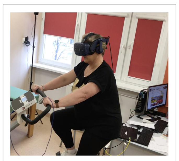
FIGURE 1 Exercise training on cycle ergometer with VR.