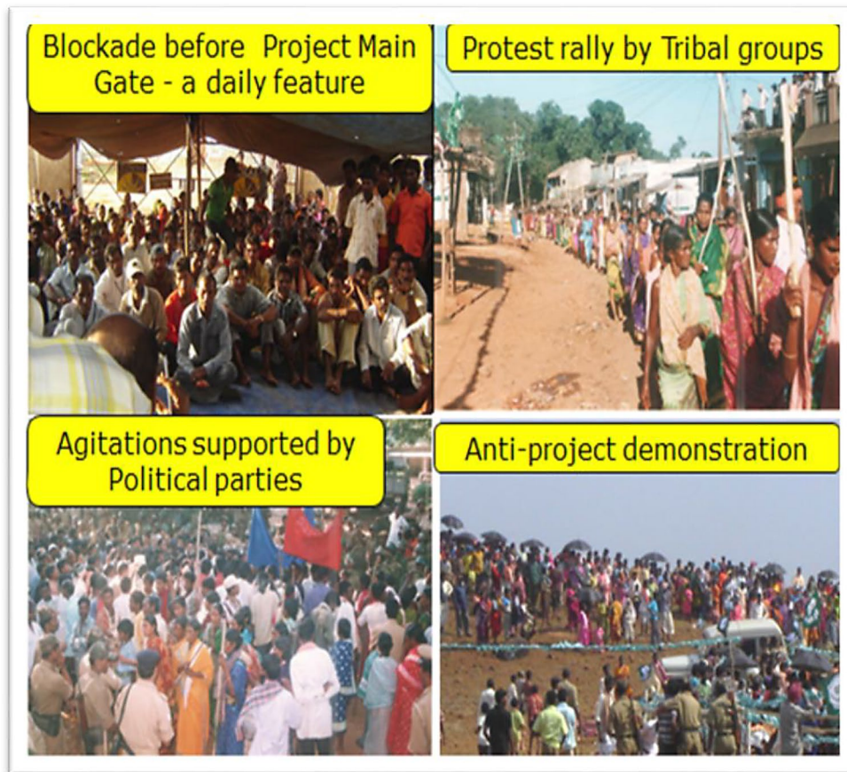
Fig. 3 Conflict in Odisha in Kashipur Block of Rayagada district.

it lacks the resources and technology to explore the deposits (Kaushal, 2017). To develop the state and its economy, the government has invited domestic and foreign investors and encouraged power, steel and aluminium companies to set up plants and factories (Kaushal, 2017). Public policy and implementation in regard to environmental and human rights issues are still in a developmental stage. Wages as well as legal and environmental standards are low in Odisha, which attracts interest from global business.