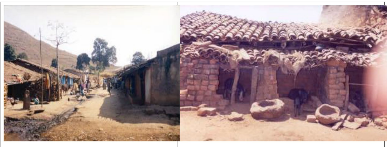
Figs. 1 and 2 A village in Kashipur Block.

Odisha is one of the poorest states of India with 33% of the population living below the poverty line (see Figs. 1, 2) and only 20% of people owning land (World Bank, 2016). Unemployment is high, and 61.8% of those who have work are involved in agricultural activities; literacy is very low (72.87% in the 2011 Census of India: see Census, 2011). The state population has a high proportion of Scheduled Tribes (also known as indigenous or ‘tribal’ people or Adivasi, 22.1%) and Dalit or Scheduled Castes (16.5%, as per the 2001 census: see Census, 2001). On the other hand, the state is rich in mineral resources and fertile land. However,