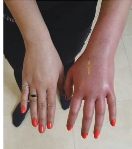
FIGURE 2: Arrows show inflammation, swelling, and redness in the metacarpal of the left hand.

Leech infestation is reported regularly due to complications of unwanted leech biting or leech therapy. Some scientists suggested that the medical leeches used in medical fields must be evaluated for pathogen contamination before using. Cellulitis has been the most common clinical manifestation, with an incidence ranging from 4.1 to 36.2 percent [14]. The use of medical leeches to treat human diseases has a long history, especially in Iran [2]. The previous study detected the main medical leeches ( Hirudo orientalis , Hirudo medicinalis , and Hirudo verbana ) in the field of medicine in Iran [15]. According to our knowledge, leech saliva contains bioactive substances such as hirudin, calin, hyaluronidase,