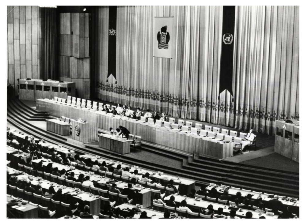
Figure 2 International Conference on Primary Health Care, September 1978 (WHO).