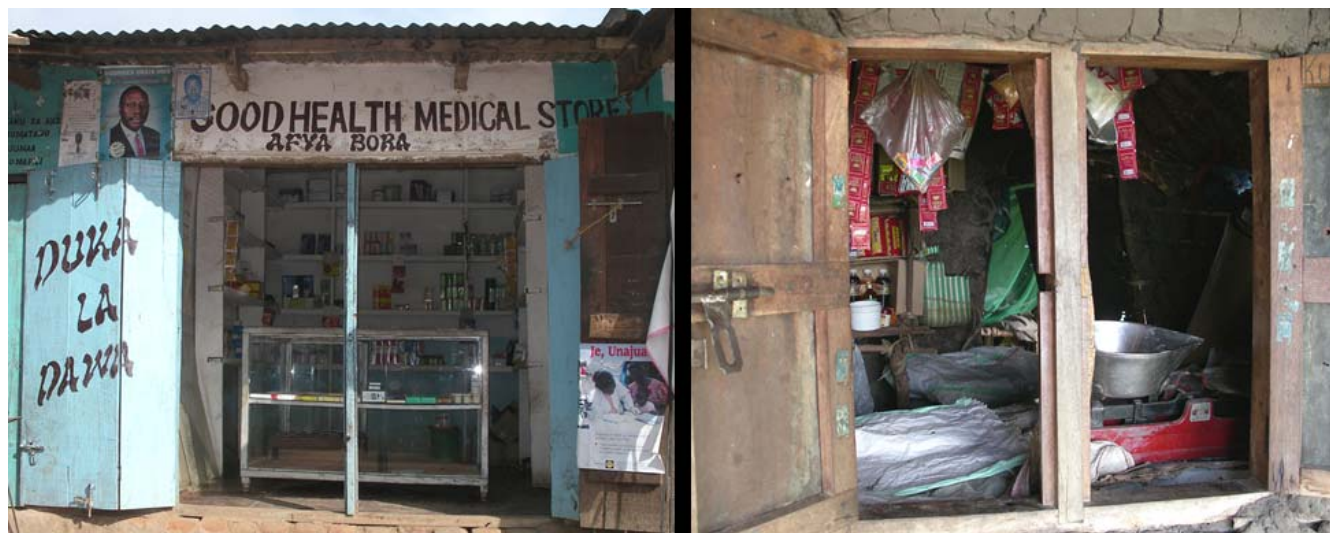
Figure 1 Examples of a part II drug store (left) and a general shop (right). Both shop types are providers of malaria treatment in rural Tanzania.

The studies presented here made use of selected key indicators in a mixed methods approach to compare factual knowledge with every-day practices of private drug retailers in treating cases of malaria in two Tanzanian districts. The research aimed to provide an assessment of the quality of malaria case-management in shops in order to inform interventions targeted at the retail sector. We included retailers in drug stores as well as general shops in